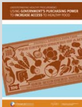
Understanding Healthy Procurement