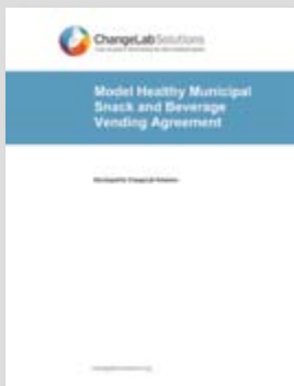
Model Healthy Municipal Snack and Beverage Vending Agreement