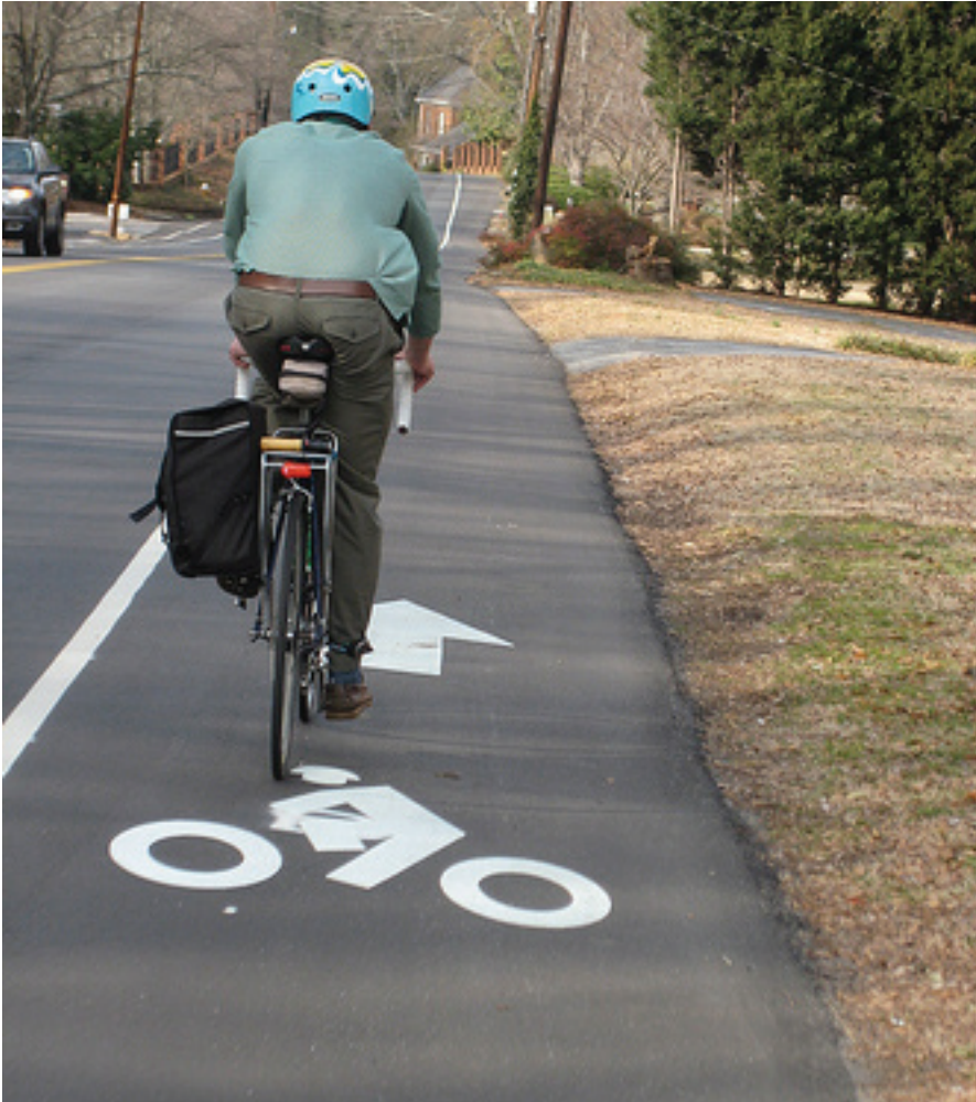
A cyclist in Greenville, South Carolina rides in a recently painted bicycle lane, which is sufficient in width to safely accommodate bicycle travel.

and others involved in the governing process and council operations. Theoretically, they provide a fair and open method for council deliberation.