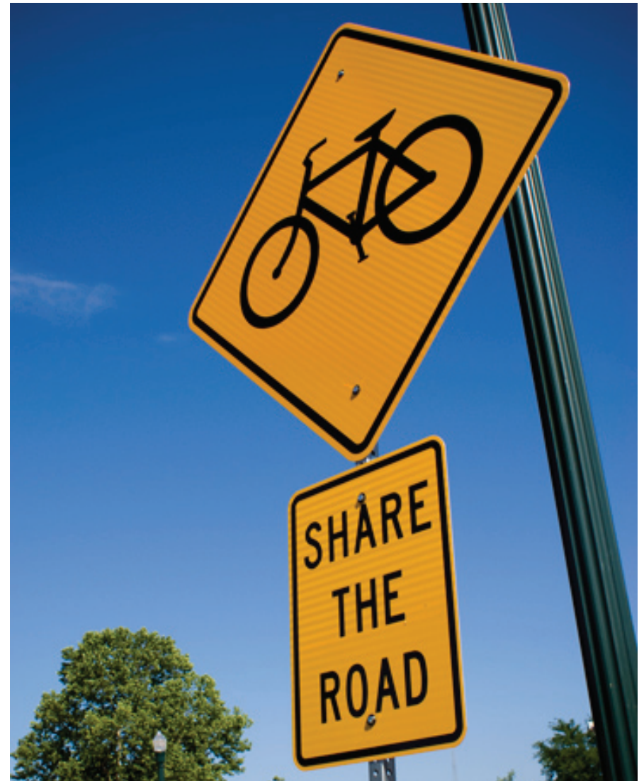
A sign along a Columbia, South Carolina roadway to remind motorists and cyclists to share the road. These signs are installed by the South Carolina Department of Transportation on roads that do not have bicycle-specific accommodations.