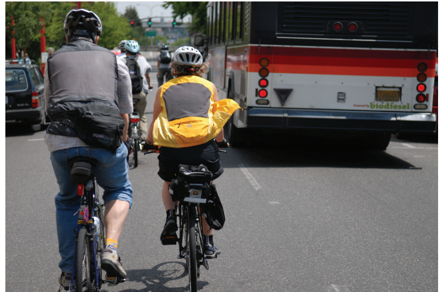
A group of bicyclists maneuvering around a stopped bus on a roadway shared by cars, buses, and trucks.