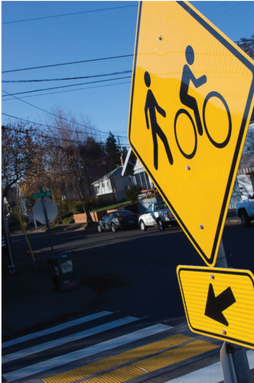
Street sign indicating pedestrian and bicycle presence.