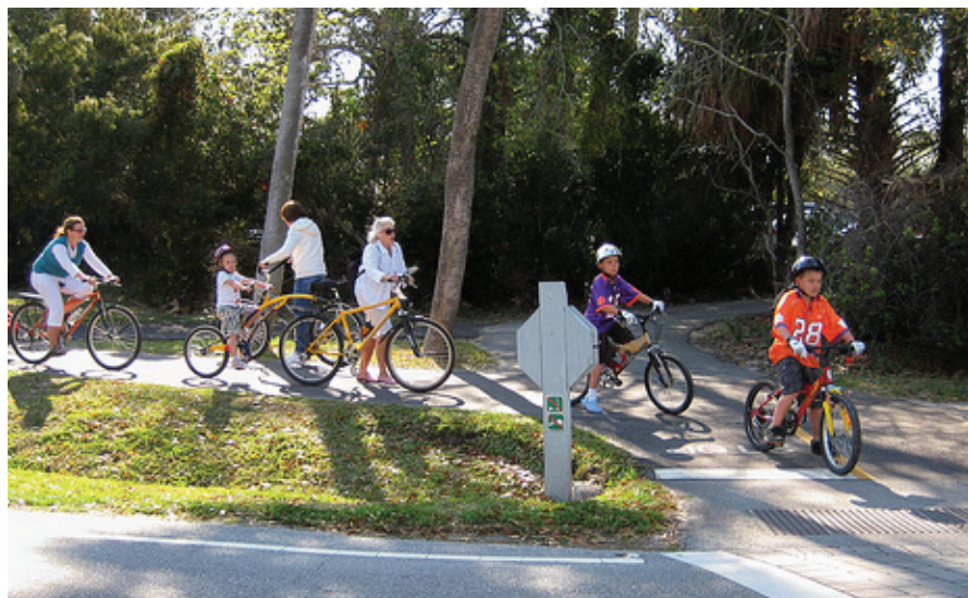
A multi-use pathway at an intersection with a road in Hilton Head, South Carolina.

Complete Streets help children. Streets that provide room for bicycling and walking help children get physical activity and gain independence. More children walk to school where there are sidewalks