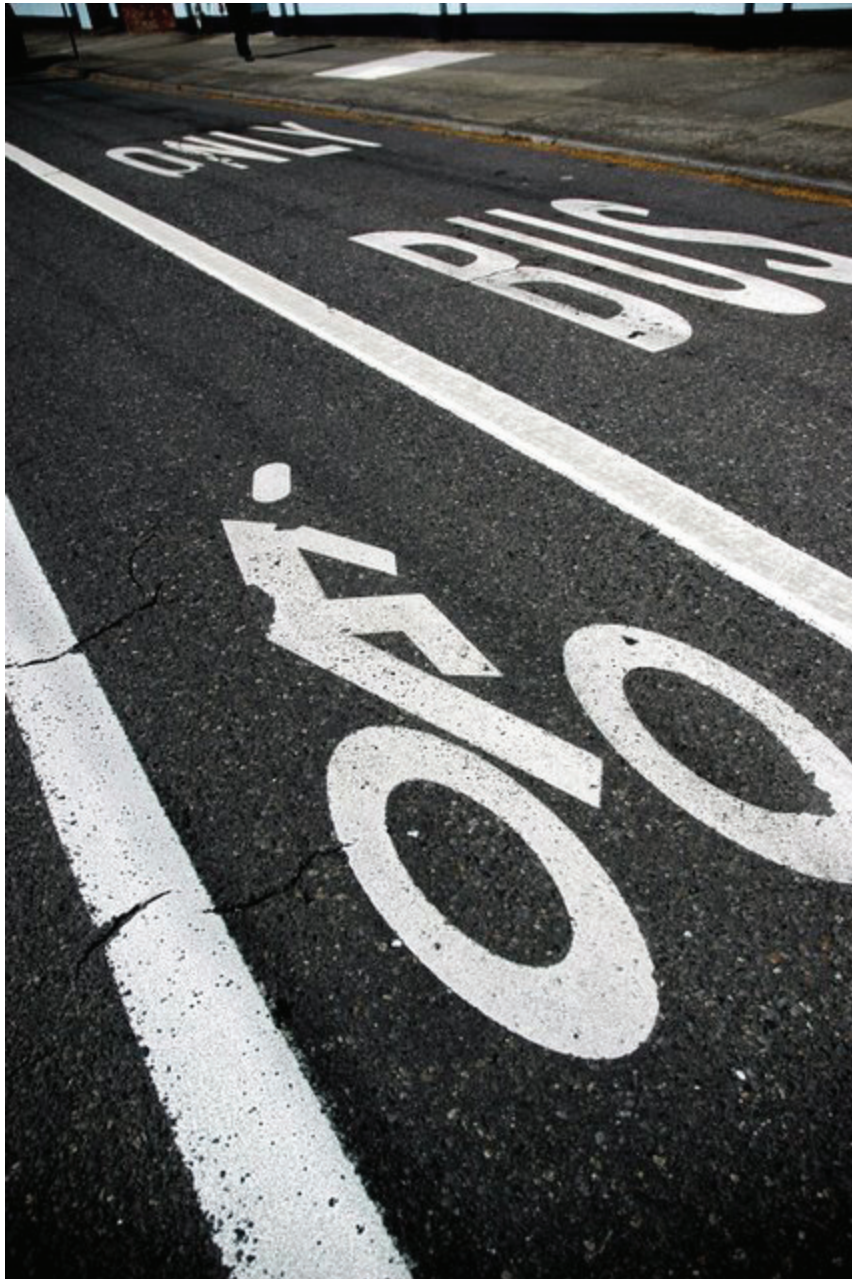
A bus-specific lane adjacent to a bicycle lane.