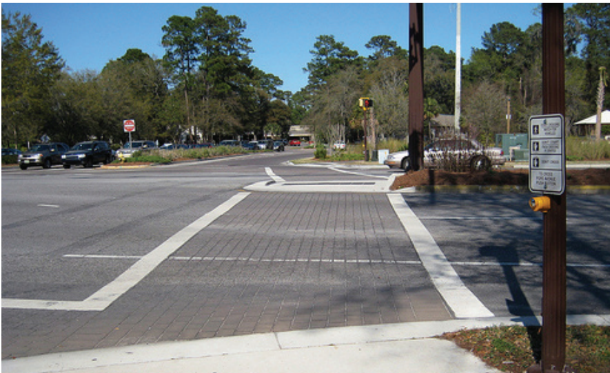
A safe, pedestrian crosswalk offers such amenities as a pedestrian activated push-button, a spacious refuge, and a gently angled cross slope.

4. Data collection—data on all users, not just vehicles, should be collected before and after a street retrofit. Consideration should be given to adopting multimodal performance standards, known as Level of Service standards, to track how well each user group is being served. Typically, Level of Service is only measured for vehicles, during the most congested hours of the day.