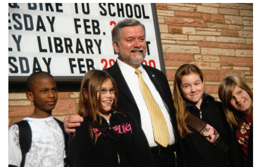
A logical partner in your Complete Streets campaign are schools and parent-teacher organizations.