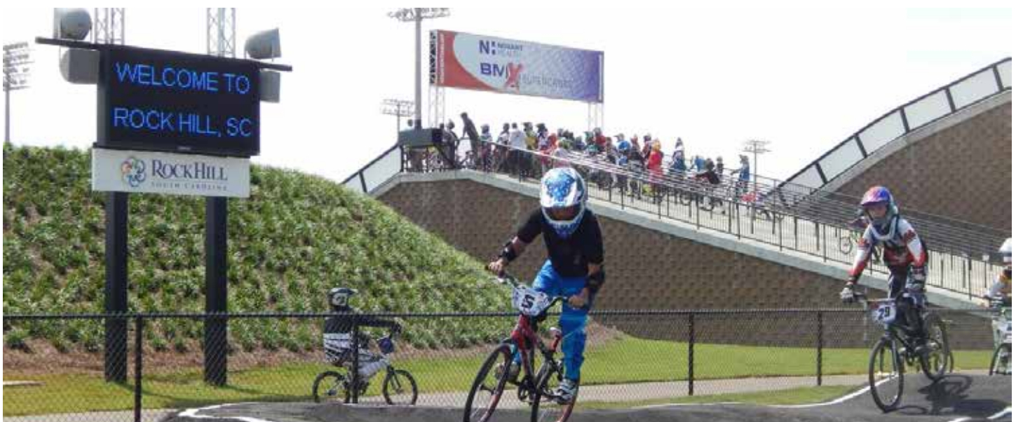
Riders participate in a BMX competition at the Novant Health BMX Supercross Track in Rock Hill.

Outdoor Recreation Supervisor, City of Rock Hill