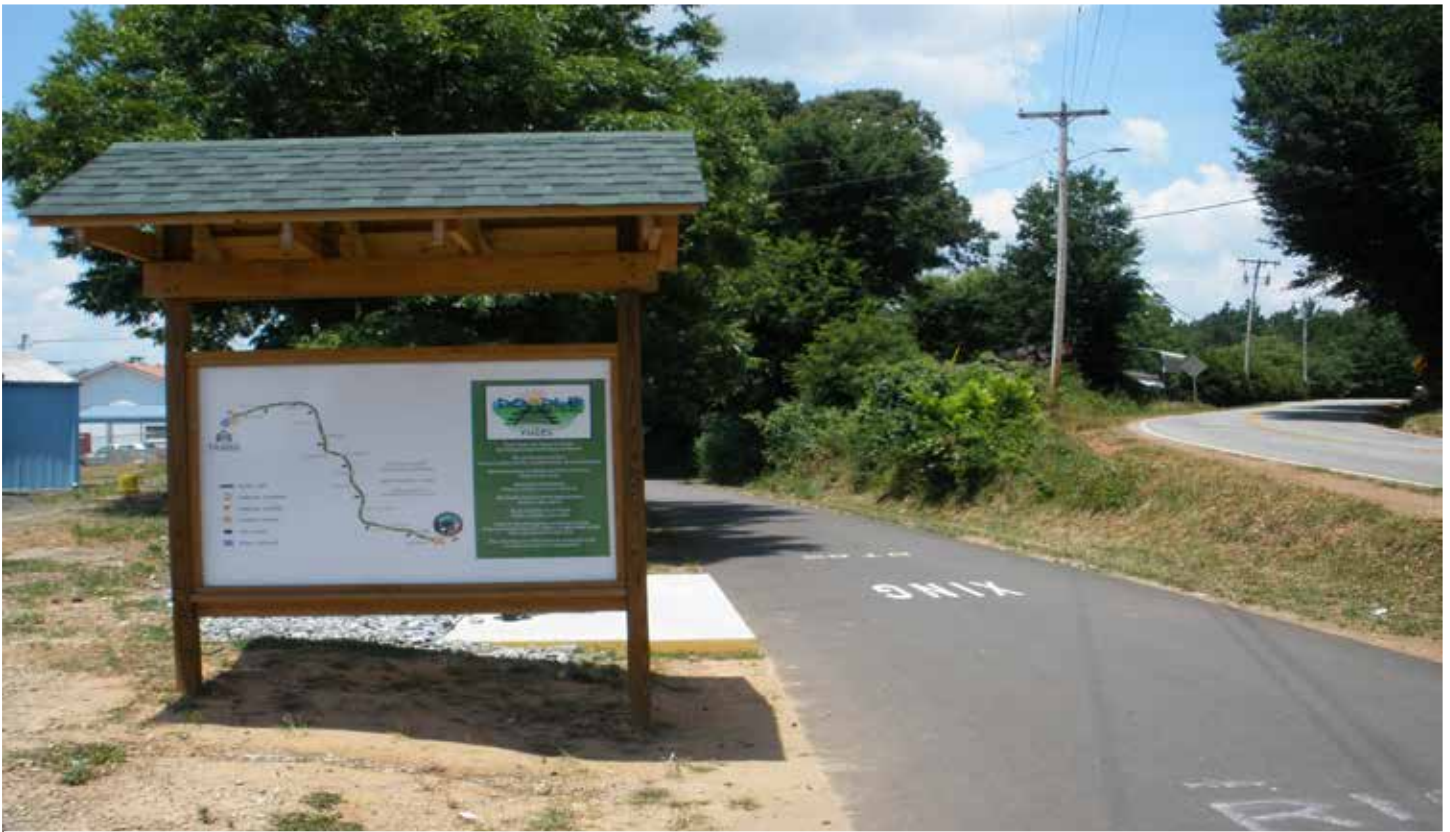
The trailhead at the start of the Doodle Trail in Easley.