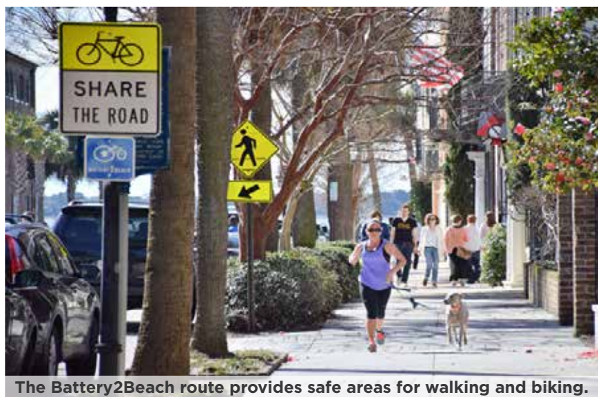
The Battery2Beach route provides safe areas for walking and biking.

Mobility Manager, Berkeley-Charleston-Dorchester Council of Governments