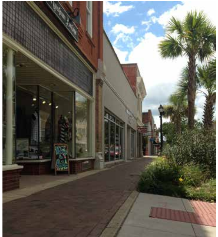
Renovations have attracted many new businesses to the area.