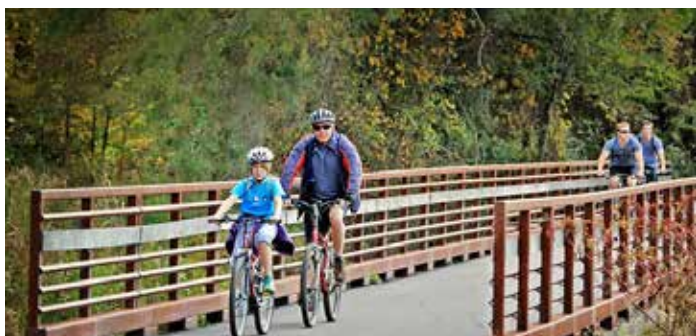
The GHS Swamp Rabbit Trail is a 21-mile greenway.