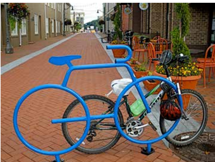
A bike rack located at the festival corridor on Wall Street.

PAL also created the state's first bike-sharing programs, Hub Cycle and BCycle. Hub Cycle rents out bikes, helmets, and locks for $15 for three months. When rentals are returned, users are refunded the rental fee. BCycle offers stations throughout the city, where users can rent bikes for $3 per 30 minutes and return rentals to any station. Stations are located downtown, at both Wofford and Converse Colleges, and at the Hub City Farmers' Market. 3