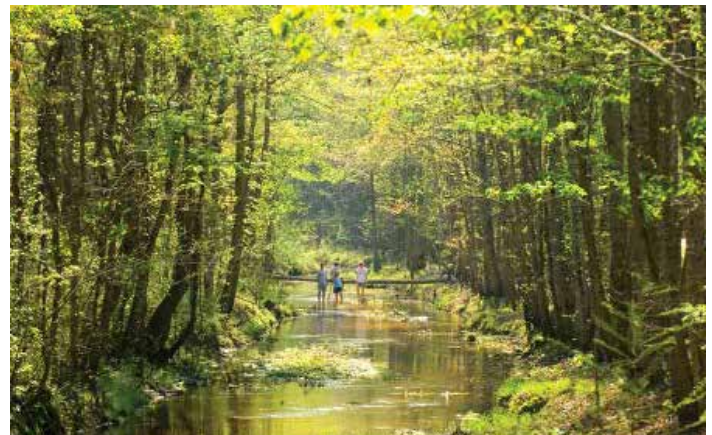
The Great Swamp Sanctuary offers 4 miles of trails.

The city is in the process of renovating the connector loop to I-95, which will include sidewalks, bike lanes, street lamps, and decorative lighting. The loop is designed to draw tourists from the highway to Walterboro's attractions, including the Great Swamp Sanctuary.