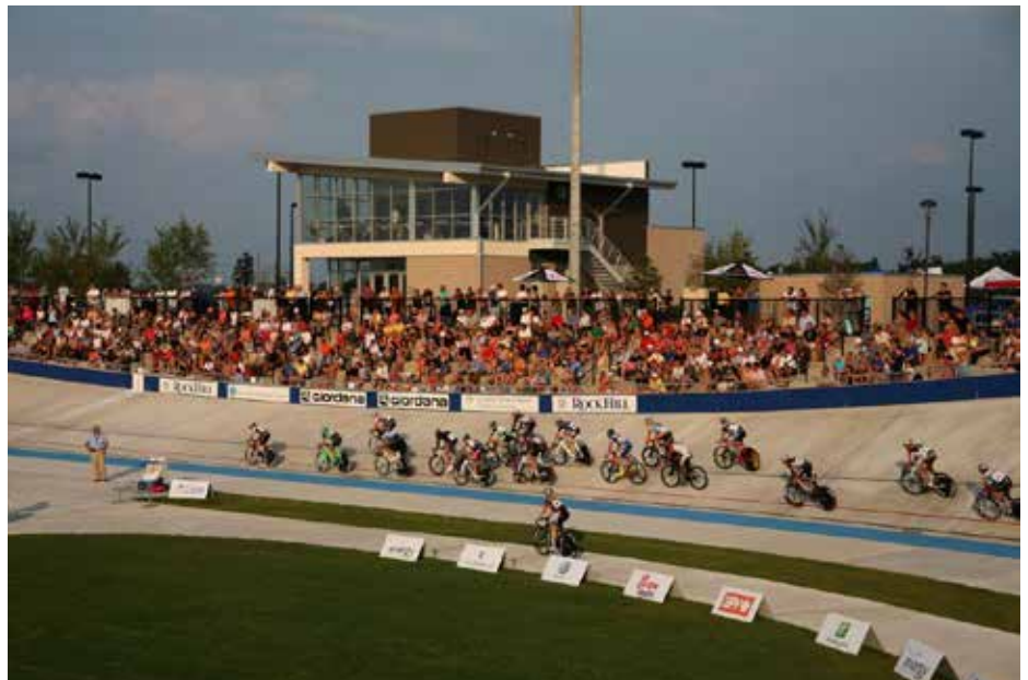
Cyclists race in competition at the Giordana Velodrome.

Through a public-private partnership, Rock Hill has created several public recreation venues at a mixed-use development along the Catawba River. Among them, a BMX track and velodrome attract thousands of visitors annually to events hosted at these venues.