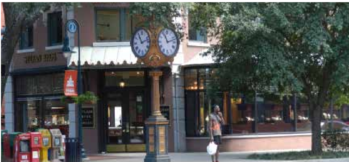
Revitalization efforts have attracted new businesses and more visitors to Columbia's Main Street.