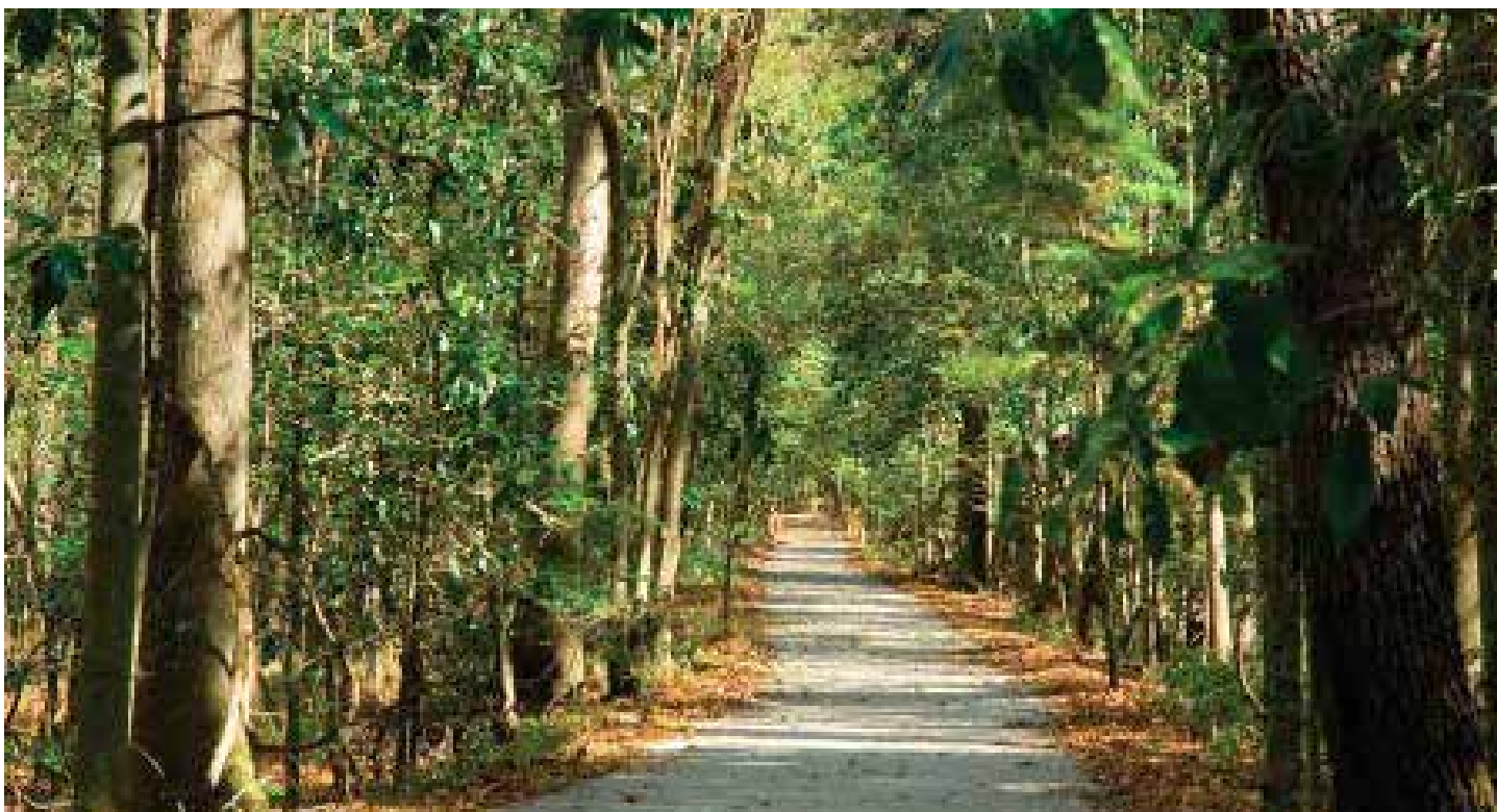
The Great Swamp Sanctuary is located in the ACE Basin, one of the largest undeveloped estuaries on the East Coast.