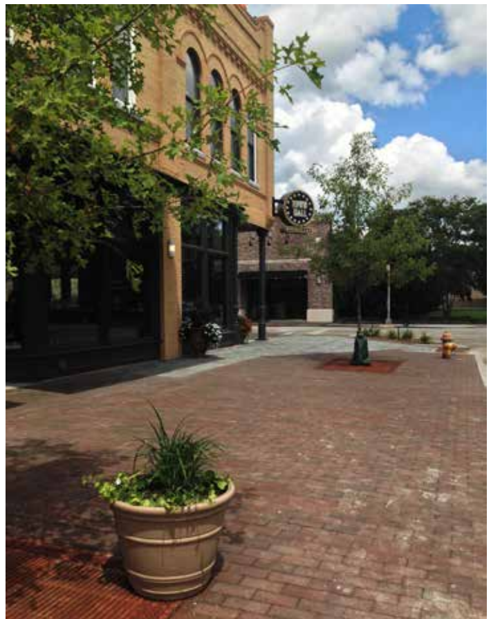
Landscaping and facade improvements revitalized Florence.