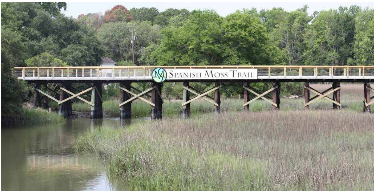
The Spanish Moss Trail passes through Beaufort's marshes, providing scenic views of the coastal area.