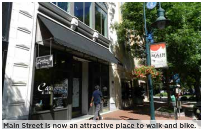
Main Street is now an attractive place to walk and bike.

Columbia has also increased biking by creating the state's first bike corral parking system, which provides on-street bike racks, where riders can pull directly off the road and into a parking spot. Columbia even created the City Employee Bike Share Program to