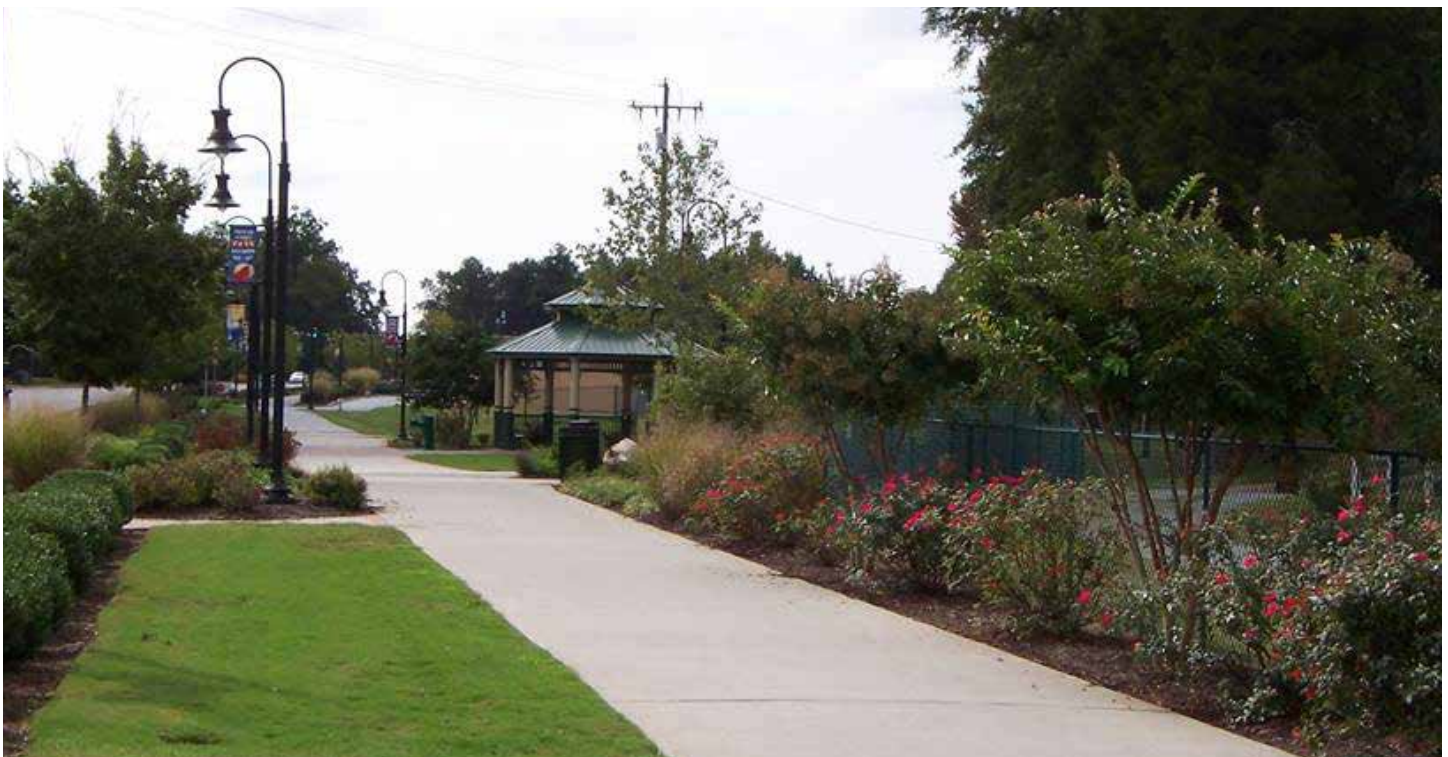
The Swamp Rabbit Trail is a major attraction in Travelers Rest and home to the farmers' market.

Executive Director, Travelers Rest Farmers' Market