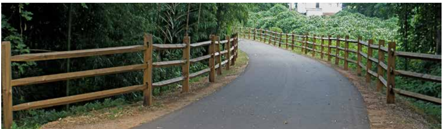
A view of the Doodle Trail, a rail trail that runs between Easley and Pickens.

Easley and Pickens jointly built a 7.5-mile paved, multi-use rail trail. Completed in 2015, the trail cost $3 million to build. Future expansions are planned, including improved trail heads, extensions into the downtown areas, and a Doodle Park. Because of the project, both cities have seen business growth due to increased tourism. Pickens' hospitality tax revenues grew 12 percent in 2015, and property values near the trail have also risen.