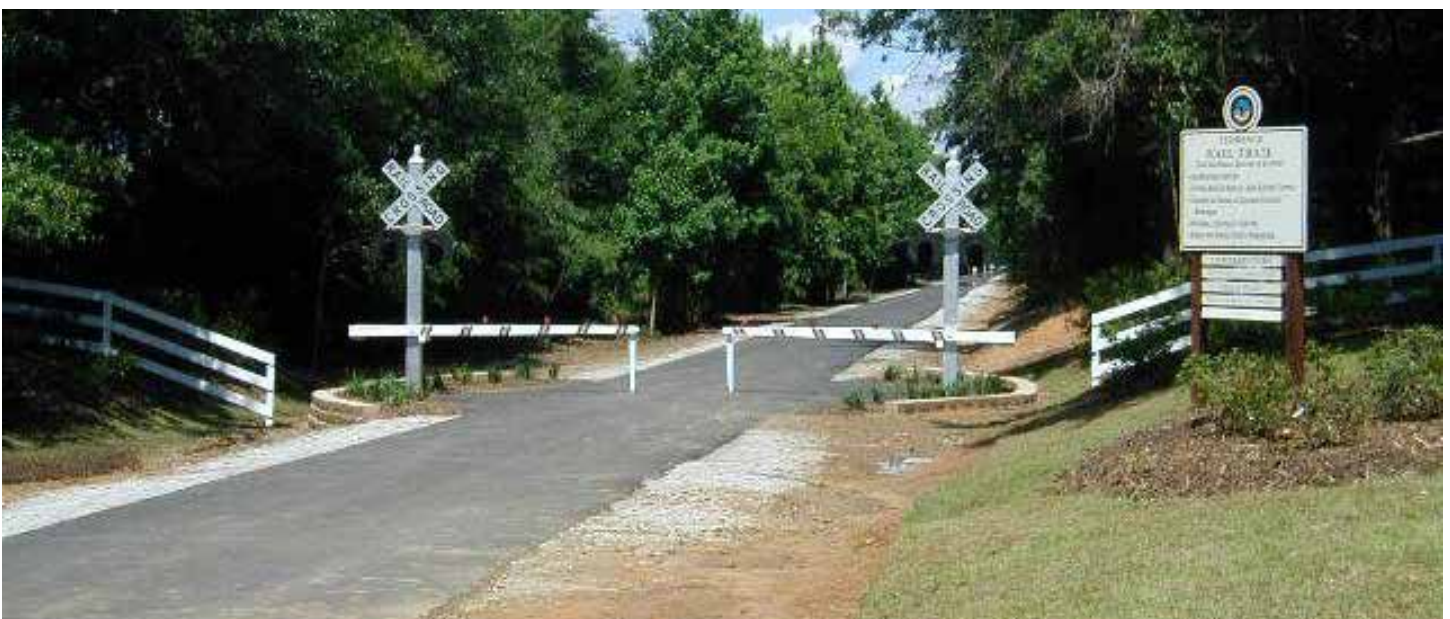
The Florence Rail Trail provides a safe location for residents to walk and bike.

The City of Florence also adopted a master plan for downtown revitalization efforts in the early 2000s. The city invested public funds and received a variety of facade and direct incentive grants to improve storefronts and create new businesses downtown. These efforts, along with sidewalk enhancements, were designed to create a safer, more attractive, and more vibrant place for pedestrians to walk in downtown Florence. 3