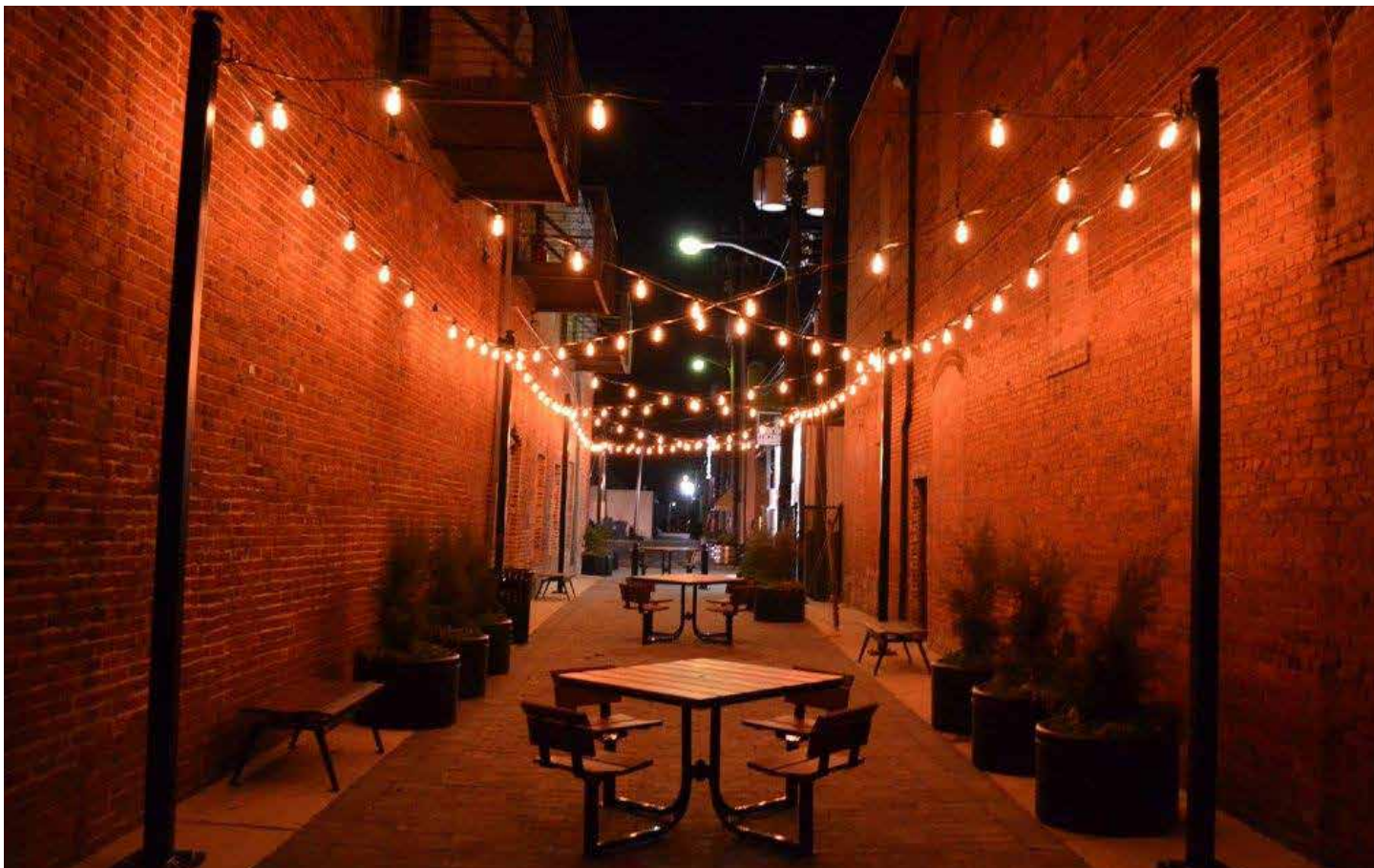
The pocket park at Mantissa Alley is a popular destination for visitors to downtown Hartsville.