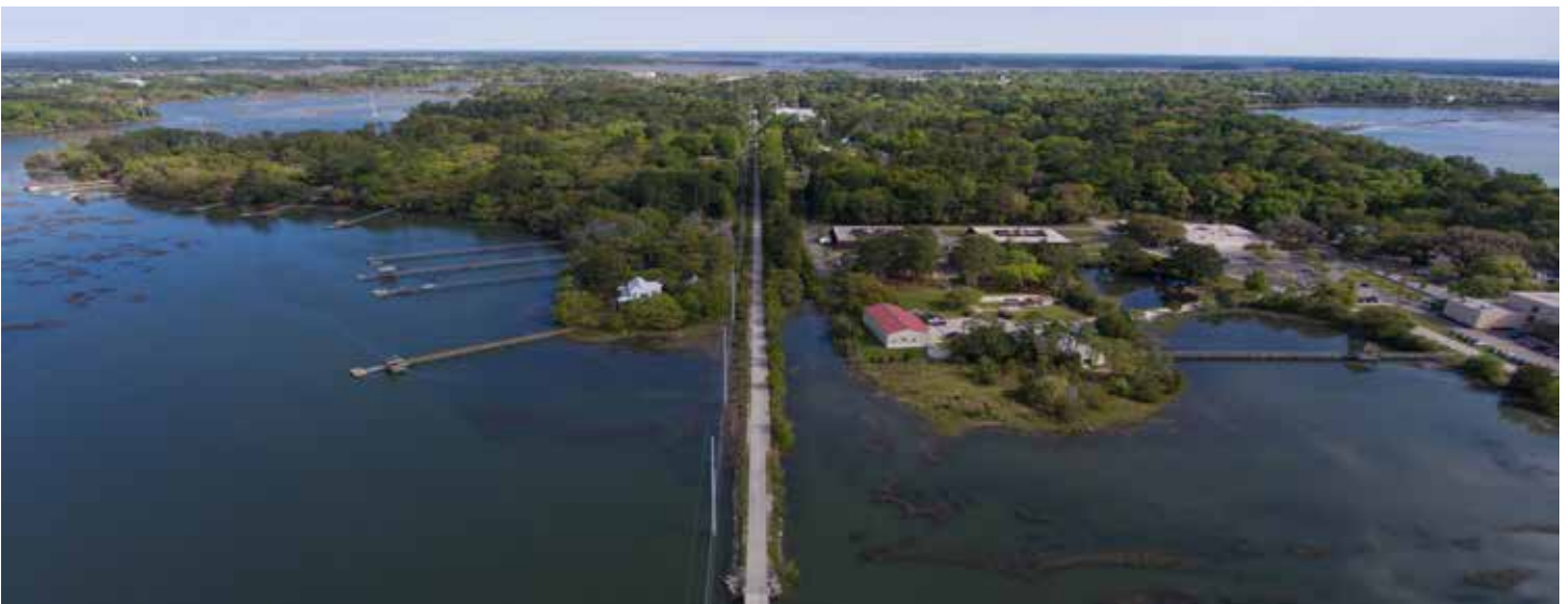
An areal view of the Spanish Moss Trail, a rail trail in Beaufort.

$4.5 million has been spent building the completed 6.5-mile section. Primary investors for the Spanish Moss Trail include: Beaufort Jasper Water & Sewer Authority, James M. Cox Foundation, Beaufort County, BlueCross BlueShield of SC, City of Beaufort, Town of Port Royal, Beaufort Memorial Hospital, and a network of private foundations, businesses, and individuals. 3