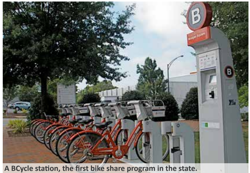
A BCycle station, the first bike share program in the state.

The renovations on East Main have also improved pedestrians' ability to visit the businesses there. The economic benefits are still rolling in, as more negotiations are underway to redevelop vacant buildings. According to Will Rothschild, communications manager for the City of Spartanburg, interest in buying properties along East Main has never been higher. 2 A brewery, several restaurants, and an AC Hotel by Marriott also recently opened new